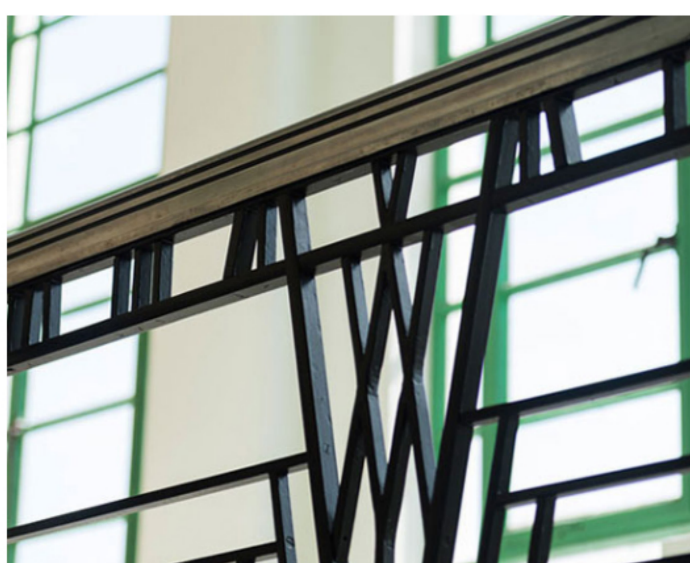
Apartments in the 1930s Wallis, Gilbert and Partners-designed art deco Hoover Building in Perivale, west London

The apartments themselves are described as having 'contemporary, open-plan interiors', as well as 'bespoke kitchens and bathrooms' and with access to gated underground parking.