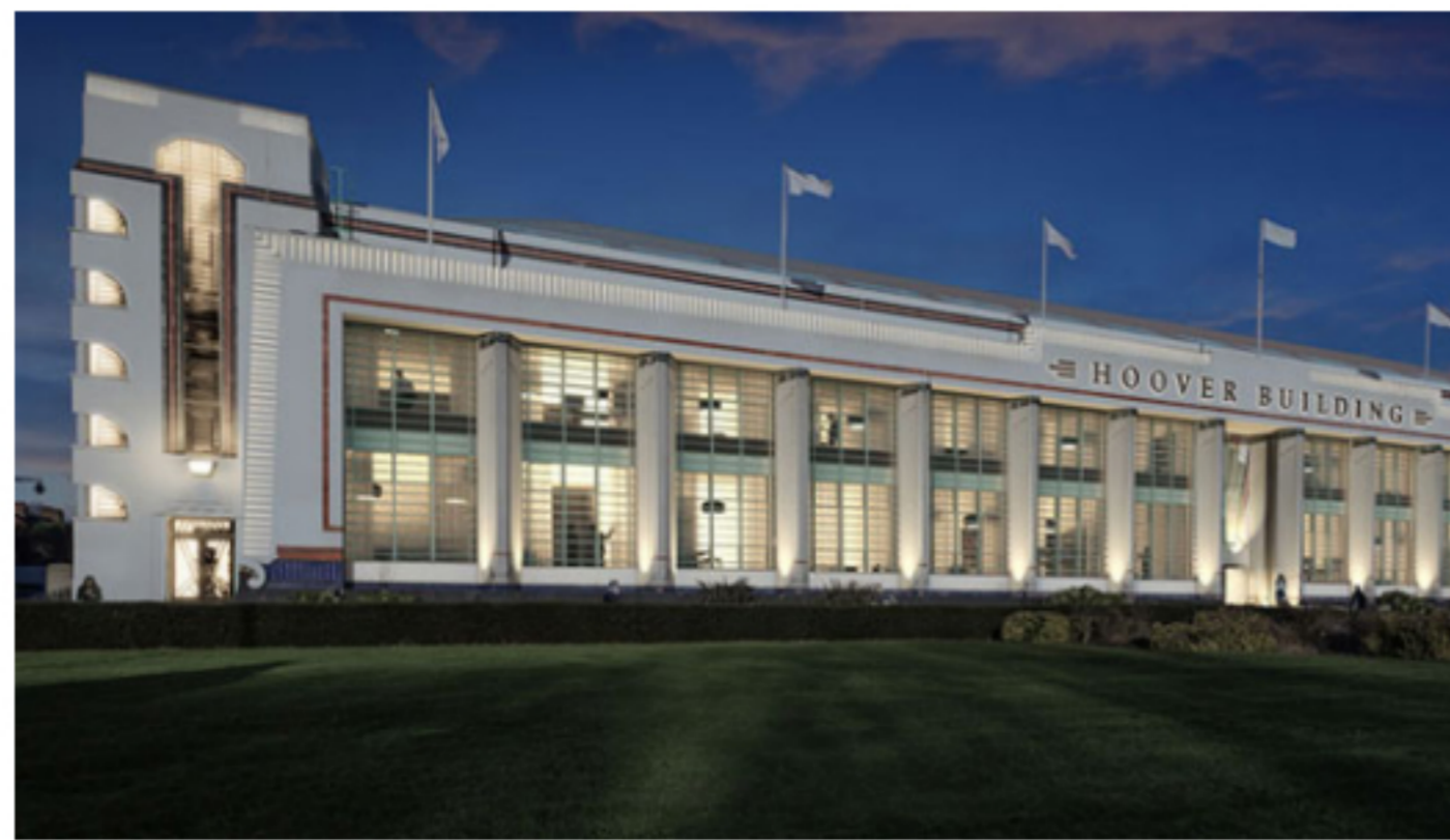
Apartments in the 1930s Wallis, Gilbert and Partners-designed art deco Hoover Building in Perivale, west London

It's an iconic building and soon you will be able to live in the 1930s Wallis, Gilbert and Partners-designed art deco Hoover Building in Perivale, west London.