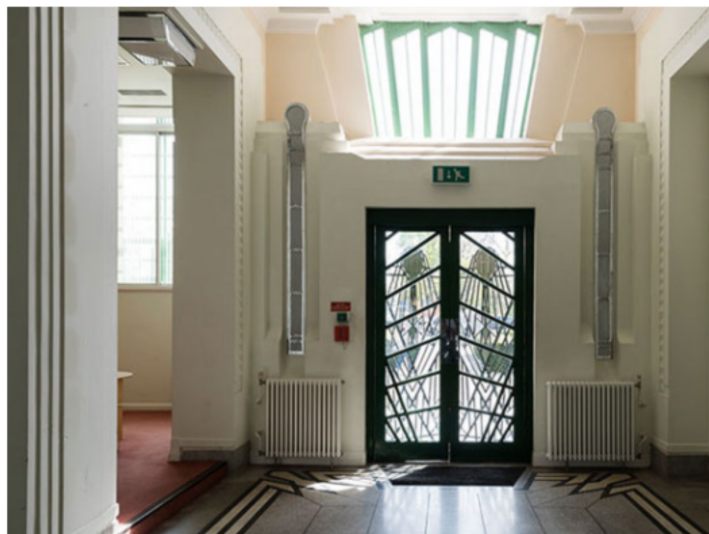
Apartments in the 1930s Wallis, Gilbert and Partners-designed art deco Hoover Building in Perivale, west London

That's because it managed to stay as a factory in the same hands (Hoover) until the 1980s, with upright cleaners still being produced here until that time. It then changed hands and inevitably fell into some disrepair before being picked up recently by IDM Properties.