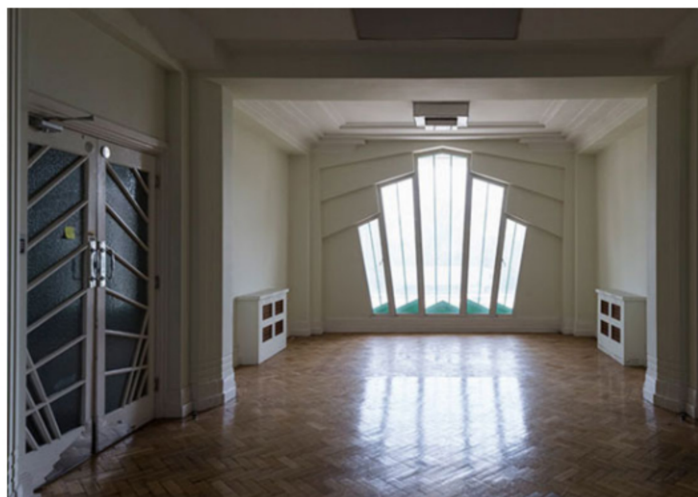
Apartments in the 1930s Wallis, Gilbert and Partners-designed art deco Hoover Building in Perivale, west London

Its plan is to transform the building into apartments, with the website promising a 'careful renovation' to transform the interior into 66 luxury 1, 2 and 3 bedroom apartments.