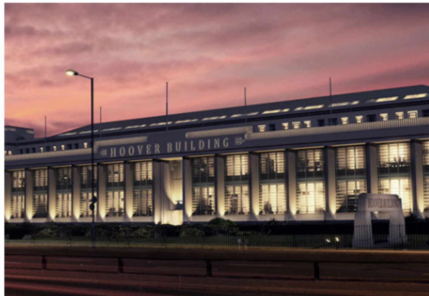
Apartments in the 1930s Wallis, Gilbert and Partners-designed art deco Hoover Building in Perivale, west London

It's an iconic building and soon you will be able to live in the 1930s Wallis, Gilbert and Partners-designed art deco Hoover Building in Perivale, west London.